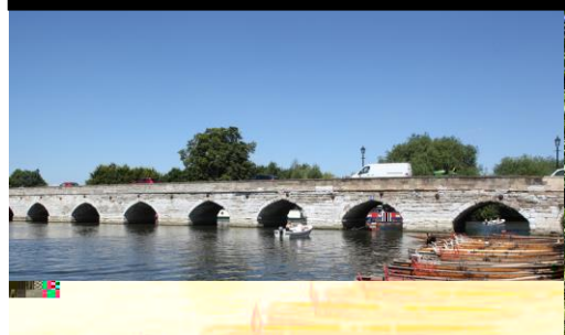
STRATFORD UPON AVON